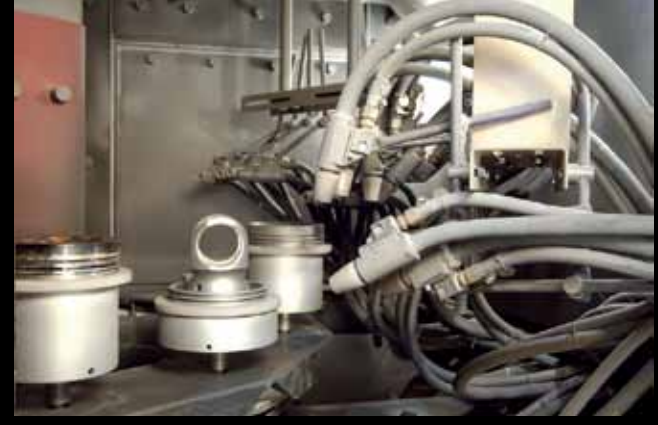
Indexing Turntable Machine coordinates 16 blast guns, oscillating vertically and horizontally, with rotating work stations to assure thorough cleaning in a single pass.

Shot-Peening Turntable includes a vibratory classifier plus closed-loop control and monitoring of shot flow, blast pressure, rotation speeds and nozzle oscillation rates.