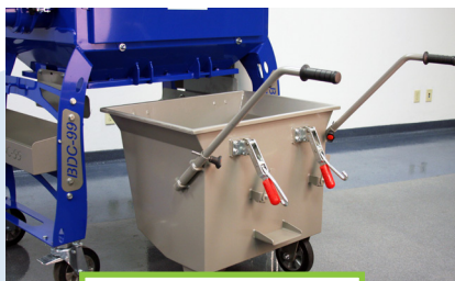
Easy Hand Click System