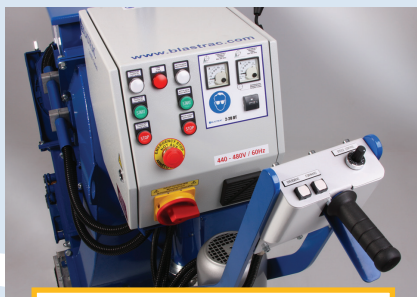
Controls are easy to access with drive adjustments on steering handle.